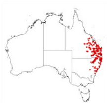
Acacia leiocalyx subsp. leiocalyx occurrence map. Occurrence map generated via Atlas of Living Australia ( https://www.ala.org.au ).