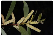
Source: Australian Plant Image Index (dig.23628). ANBG © M. Fagg, 2012