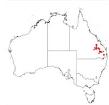
Acacia leichhardtii occurrence map. Occurrence map generated via Atlas of Living Australia ( https://www.ala.org.au ).