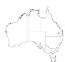
Acacia lauta occurrence map. Occurrence map generated via Atlas of Living Australia ( https://www.ala.org.au ).