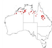
Acacia laccata occurrence map. Occurrence map generated via Atlas of Living Australia ( https://www.ala.org.au ).