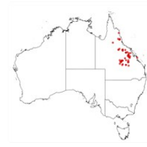
Acacia julifera subsp. curvinervia occurrence map. Occurrence map generated via Atlas of Living Australia ( https://www.ala.org.au ).