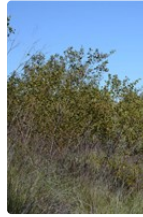
Source: Australian Plant Image Index (dig.25612). ANBG © M. Fagg, 2012