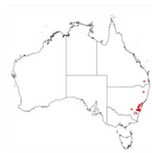
Acacia jonesii occurrence map. Occurrence map generated via Atlas of Living Australia ( https://www.ala.org.au ).