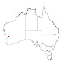
Acacia inceana subsp. latifolia occurrence map. Occurrence map generated via Atlas of Living Australia ( https://www.ala.org.au ).