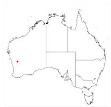
Acacia imitans occurrence map. Occurrence map generated via Atlas of Living Australia ( https://www.ala.org.au ).