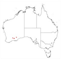
Acacia hystrix subsp. continua occurrence map. Occurrence map generated via Atlas of Living Australia ( https://www.ala.org.au ).