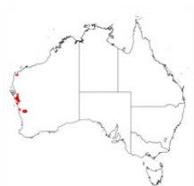
Acacia hopperiana occurrence map. Occurrence map generated via Atlas of Living Australia ( https://www.ala.org.au ).