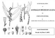
See illustration.