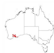
Acacia hadrophylla occurrence map. Occurrence map generated via Atlas of Living Australia ( https://www.ala.org.au ).