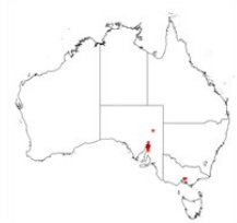
Acacia gracilifolia occurrence map. Occurrence map generated via Atlas of Living Australia ( https://www.ala.org.au ).