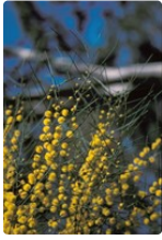
Buds and flowers. Jervis Bay, Botanical Garden, NSW.