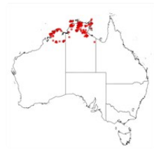
Acacia gonocarpa occurrence map. Occurrence map generated via Atlas of Living Australia ( https://www.ala.org.au ).