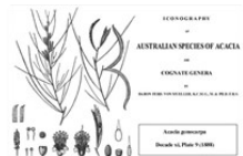
See illustration.