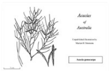
See illustration.