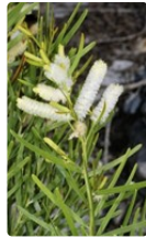
Source: WorldWideWattle ver. 2. Published at: www.worldwidewattle.com Kym Brennan