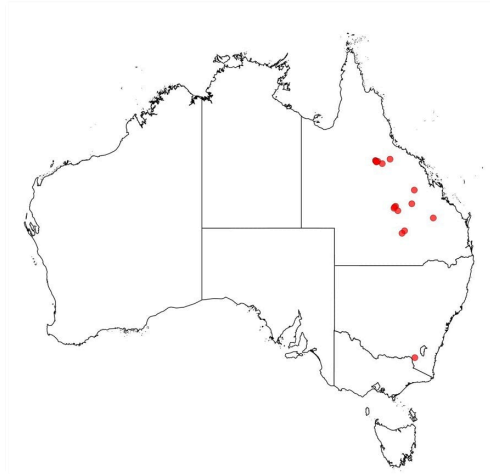
Acacia gnidium occurrence map. Occurrence map generated via Atlas of Living Australia ( https://www.ala.org.au ).

See illustration.