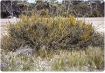
Source: WorldWideWattle ver. 2. Published at: www.worldwidewattle.com B.R. Maslin