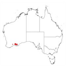
Acacia glaucissima occurrence map. Occurrence map generated via Atlas of Living Australia ( https://www.ala.org.au ).