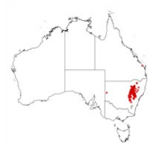
Acacia gladiiformis occurrence map. Occurrence map generated via Atlas of Living Australia ( https://www.ala.org.au ).