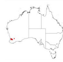
Acacia gemina occurrence map. Occurrence map generated via Atlas of Living Australia ( https://www.ala.org.au ).