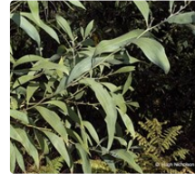
Source: WorldWideWattle ver. 2. Published at: www.worldwidewattle.com Hugh Nicholson