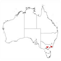
Acacia frigescens occurrence map. Occurrence map generated via Atlas of Living Australia ( https://www.ala.org.au ).