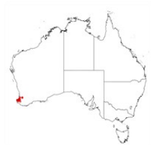
Acacia flagelliformis occurrence map. Occurrence map generated via Atlas of Living Australia ( https://www.ala.org.au ).