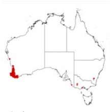
Acacia extensa occurrence map. Occurrence map generated via Atlas of Living Australia ( https://www.ala.org.au ).