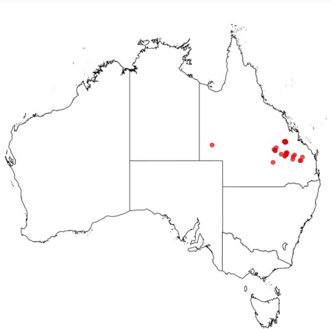
Acacia everistii occurrence map. Occurrence map generated via Atlas of Living Australia ( https://www.ala.org.au ).

Source: WorldWideWattle ver. 2. Published at: www.worldwidewattle.com See illustration.