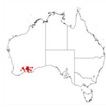
Acacia evenulosa occurrence map. Occurrence map generated via Atlas of Living Australia ( https://www.ala.org.au ).