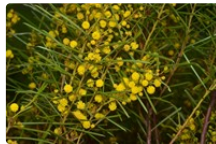
Source: Australian Plant Image Index (dig.39569). ANBG © M. Fagg, 2015