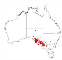
Acacia euthycarpa occurrence map. Occurrence map generated via Atlas of Living Australia ( https://www.ala.org.au ).