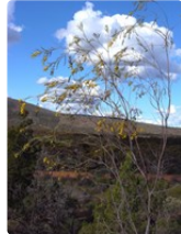
Source: Australian Plant Image Index (dig.38663). ANBG © M. Fagg, 2015