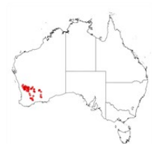
Acacia enervia subsp. explicata occurrence map. Occurrence map generated via Atlas of Living Australia ( https://www.ala.org.au ).