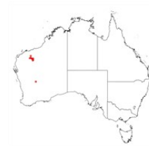
Acacia effusa occurrence map. Occurrence map generated via Atlas of Living Australia ( https://www.ala.org.au ).