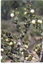
Source: WorldWideWattle ver. 2. Published at: www.worldwidewattle.com B.R. Maslin