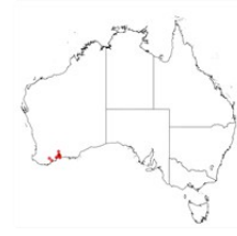
Acacia durabilis occurrence map. Occurrence map generated via Atlas of Living Australia ( https://www.ala.org.au ).