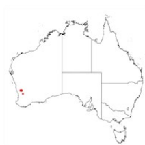
Acacia dura occurrence map. Occurrence map generated via Atlas of Living Australia ( https://www.ala.org.au ).