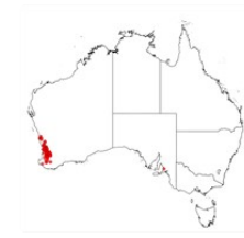
Acacia drummondii subsp. drummondii occurrence map. Occurrence map generated via Atlas of Living Australia ( https://www.ala.org.au ).