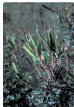
Acacia drummondii subsp. drummondii Green pods. Boonanarring, WA.