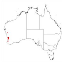
Acacia drummondii subsp. affinis occurrence map. Occurrence map generated via Atlas of Living Australia ( https://www.ala.org.au ).