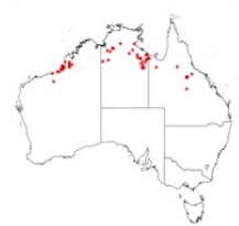
Acacia drepanocarpa subsp. drepanocarpa occurrence map. Occurrence map generated via Atlas of Living Australia ( https://www.ala.org.au ).