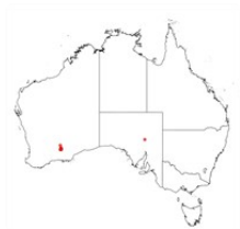
Acacia dorsenna occurrence map. Occurrence map generated via Atlas of Living Australia ( https://www.ala.org.au ).