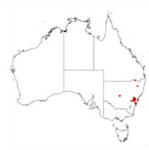
Acacia dorothea occurrence map. Occurrence map generated via Atlas of Living Australia ( https://www.ala.org.au ).