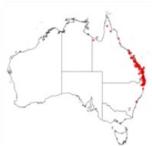
Acacia disparrima subsp. disparrima occurrence map. Occurrence map generated via Atlas of Living Australia ( https://www.ala.org.au ).