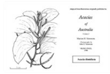
See illustration.