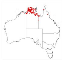
Acacia dimidiata occurrence map. Occurrence map generated via Atlas of Living Australia ( https://www.ala.org.au ).