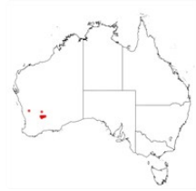
Acacia desertorum var. nudipes occurrence map. Occurrence map generated via Atlas of Living Australia ( https://www.ala.org.au ).

See illustration.