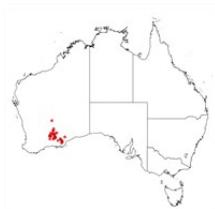
Acacia dempsteri occurrence map. Occurrence map generated via Atlas of Living Australia ( https://www.ala.org.au ).