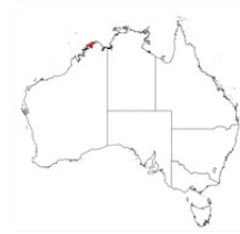
Acacia deltoidea subsp. ampla occurrence map. Occurrence map generated via Atlas of Living Australia ( https://www.ala.org.au ).