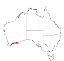
Acacia delphina occurrence map. Occurrence map generated via Atlas of Living Australia ( https://www.ala.org.au ).