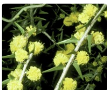
Source: WorldWideWattle ver. 2. Published at: www.worldwidewattle.com B.R. Maslin