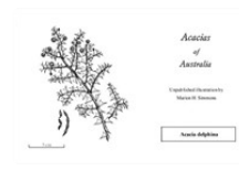
See illustration.