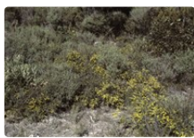
Source: WorldWideWattle ver. 2. Published at: www.worldwidewattle.com B.R. Maslin