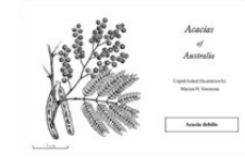
See illustration.