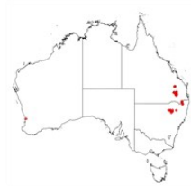
Acacia debilis occurrence map. Occurrence map generated via Atlas of Living Australia ( https://www.ala.org.au ).