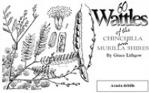
See illustration.