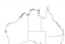
Acacia dallachiana occurrence map. Occurrence map generated via Atlas of Living Australia ( https://www.ala.org.au ).