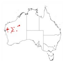
Acacia cuthbertsonii subsp. linearis occurrence map.

Occurrence map generated via Atlas of Living Australia ( https://www.ala.org.au ).