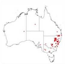
Acacia cultriformis occurrence map. Occurrence map generated via Atlas of Living Australia ( https://www.ala.org.au ).