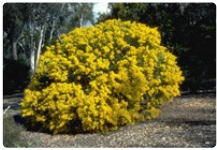
Source: Australian Plant Image Index (a.3458). ANBG © M. Fagg, 1978