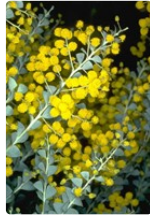
Source: Australian Plant Image Index (a.3457). ANBG © M. Fagg, 1978