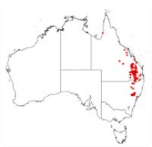
Acacia crassa subsp. crassa occurrence map. Occurrence map generated via Atlas of Living Australia ( https://www.ala.org.au ).