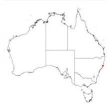
Acacia courtii occurrence map. Occurrence map generated via Atlas of Living Australia ( https://www.ala.org.au ).