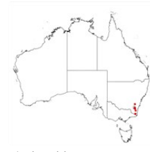
Acacia costiniana occurrence map. Occurrence map generated via Atlas of Living Australia ( https://www.ala.org.au ).