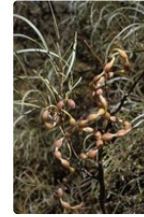
Source: WorldWideWattle ver. 2. Published at: www.worldwidewattle.com J. Maslin