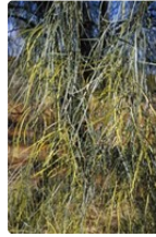
Source: WorldWideWattle ver. 2. Published at: www.worldwidewattle.com B.R., Maslin