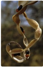
Source: WorldWideWattle ver. 2. Published at: www.worldwidewattle.com J. Maslin