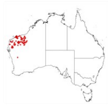
Acacia coriacea subsp. pendens occurrence map. Occurrence map generated via Atlas of Living Australia ( https://www.ala.org.au ).