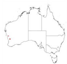
Acacia congesta subsp. wonganensis occurrence map. Occurrence map generated via Atlas of Living Australia ( https://www.ala.org.au ).