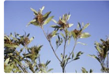
Source: WorldWideWattle ver. 2. Published at: www.worldwidewattle.com J. Maslin