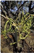
Source: WorldWideWattle ver. 2. Published at: www.worldwidewattle.com J. Maslin