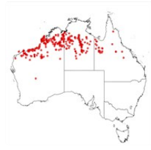
Acacia colei var. colei occurrence map. Occurrence map generated via Atlas of Living Australia ( https://www.ala.org.au ).