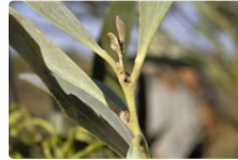
Source: WorldWideWattle ver. 2. Published at: www.worldwidewattle.com J. Maslin