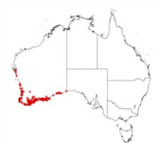
Acacia cochlearis occurrence map. Occurrence map generated via Atlas of Living Australia ( https://www.ala.org.au ).